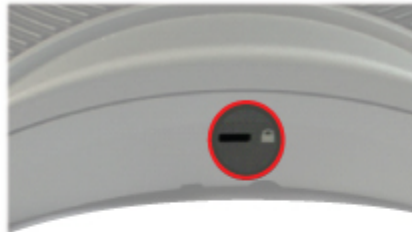
SoundStation IP Phones