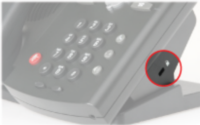
SoundPoint IP Phones